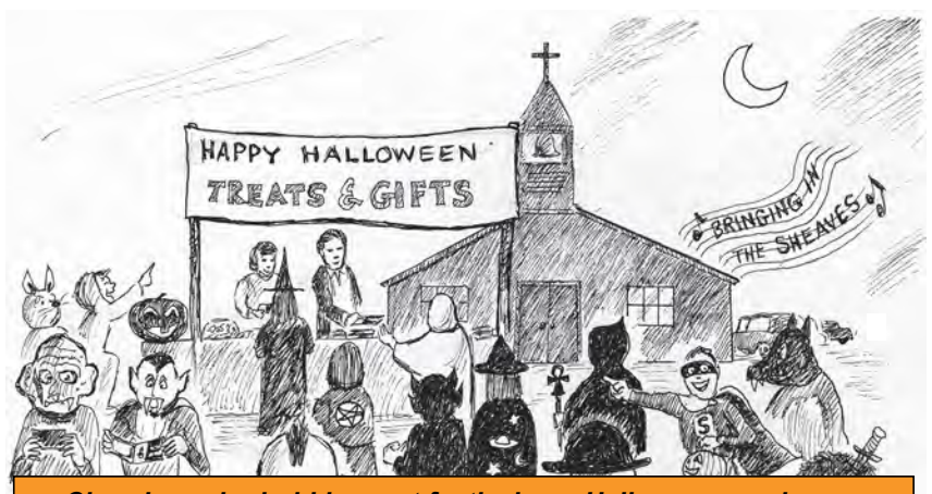
Churches who hold harvest festivals on Halloween can have a booth on the street for the trick-or-treaters who come by.