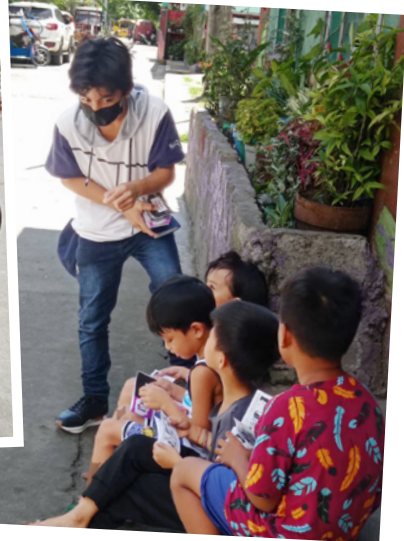
Here a group of boys receives those precious tracts.

In this picture, one of the street preachers on these teams gives Chick tracts to Philippine youth.