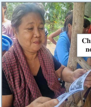
Chick tract reader in northern Thailand

100% OF THE MONEY YOU SEND TO THE CHICK MISSIONS FUND IS USED TO SHIP LITERATURE TO MISSIONARIES.