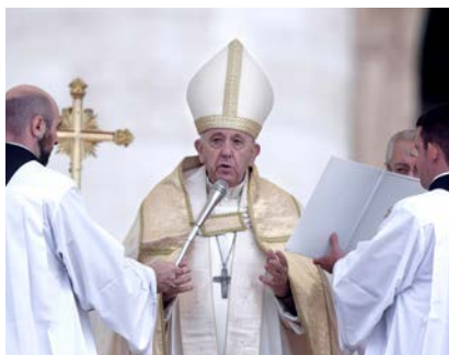
Pope Francis leads a mass to beautify Pope John Paul I. Nowhere does scripture condone prayers to the dead.