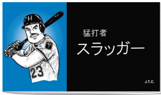
“The Slugger” in Japanese

being sent out of White Horse Baptist Church in Greenville, SC. This faithful church has been pumping relief supplies and literature into Ukraine since the start of the war.